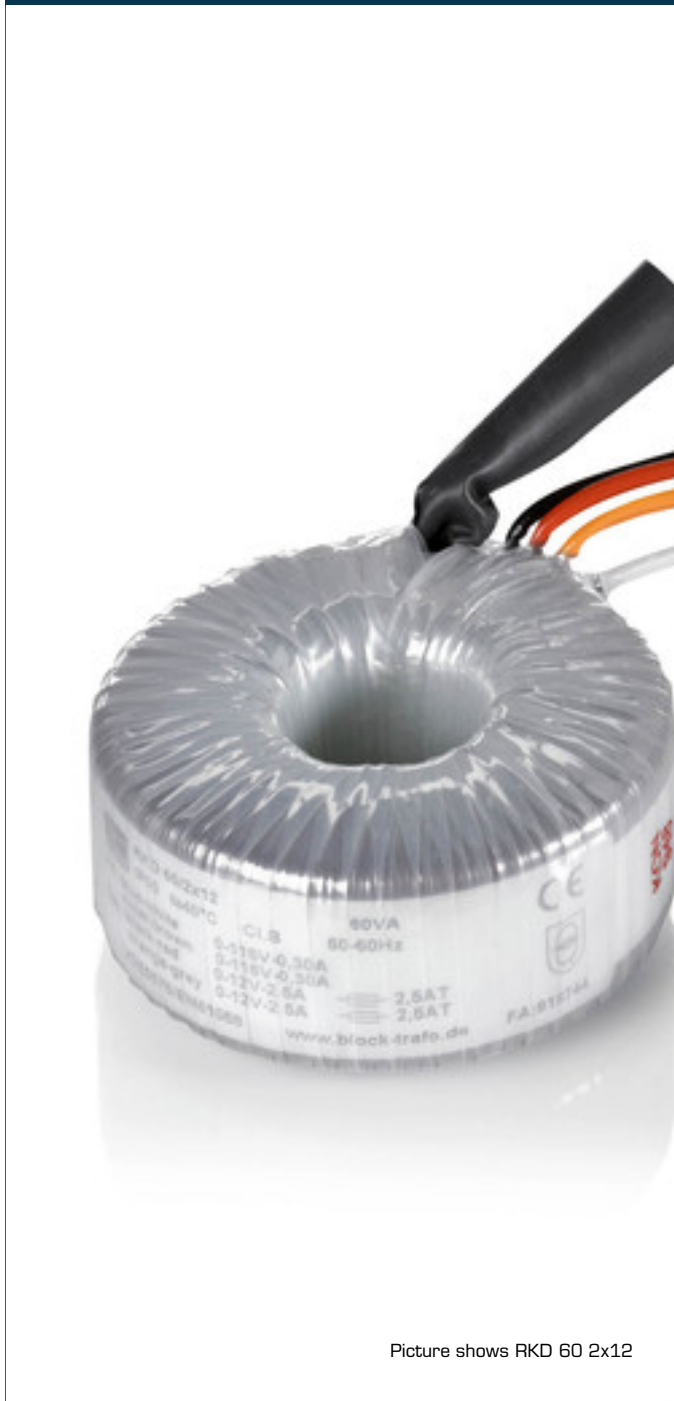
Picture shows RKD 60 2x12