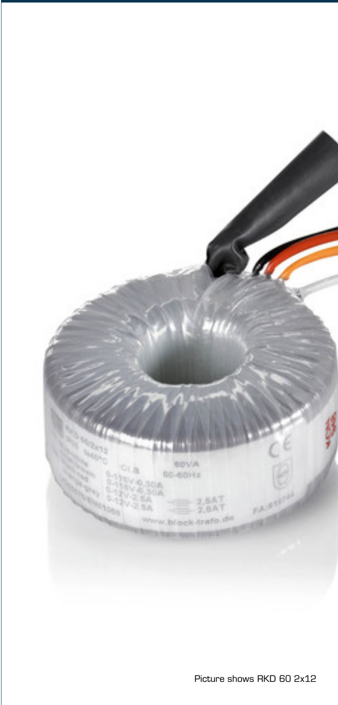
Picture shows RKD 60 2x12