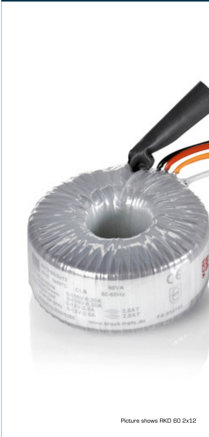
Picture shows RKD 60 2x12