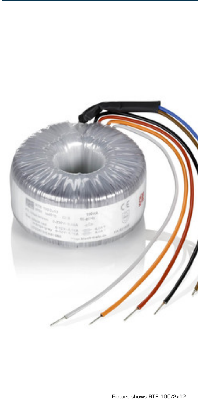
Picture shows RTE 100/2x12