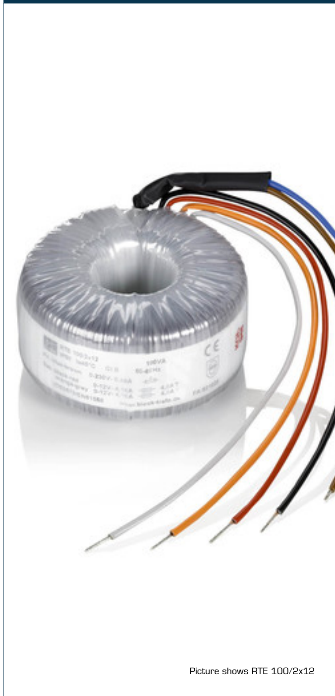
Picture shows RTE 100/2x12