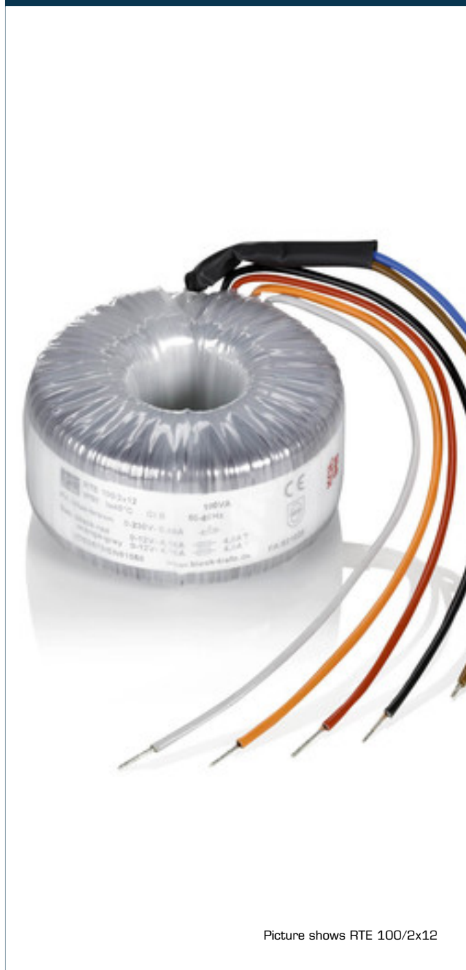
Picture shows RTE 100/2x12