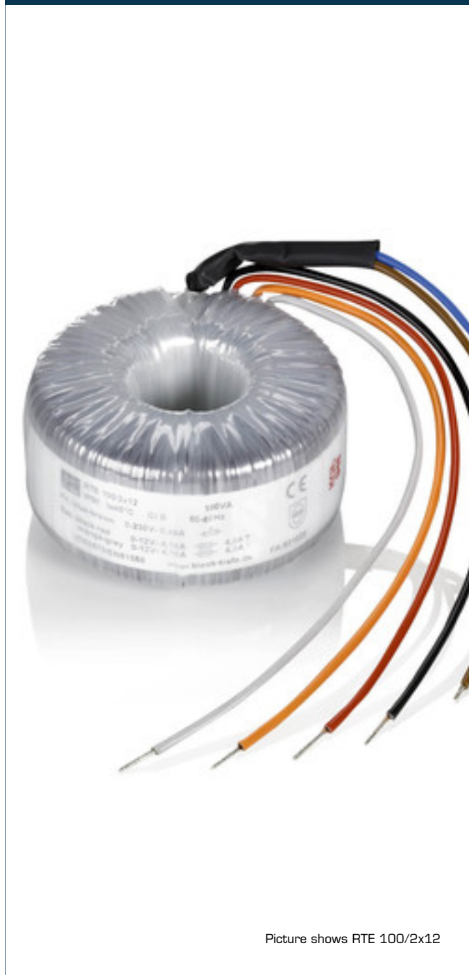
Picture shows RTE 100/2x12