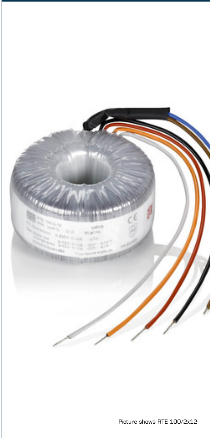
Picture shows RTE 100/2x12