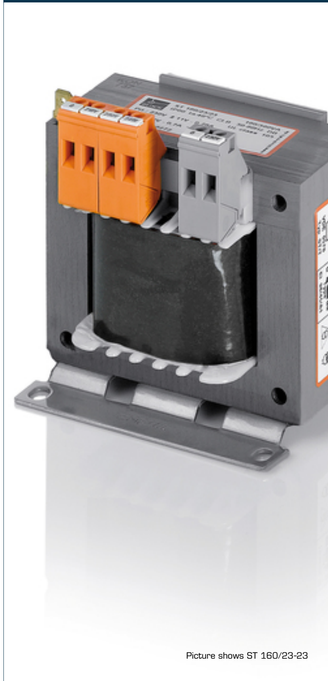
Picture shows ST 160/23-23