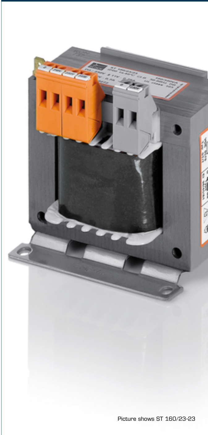
Picture shows ST 160/23-23