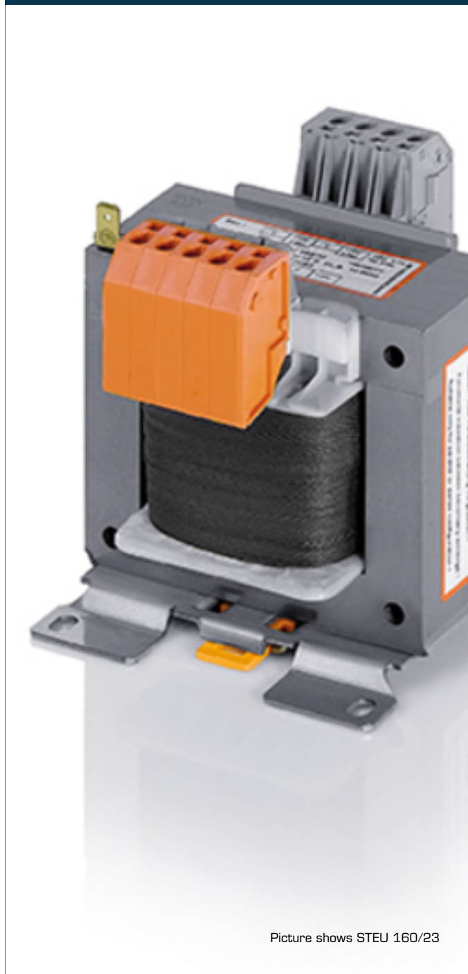
Picture shows STEU 160/23