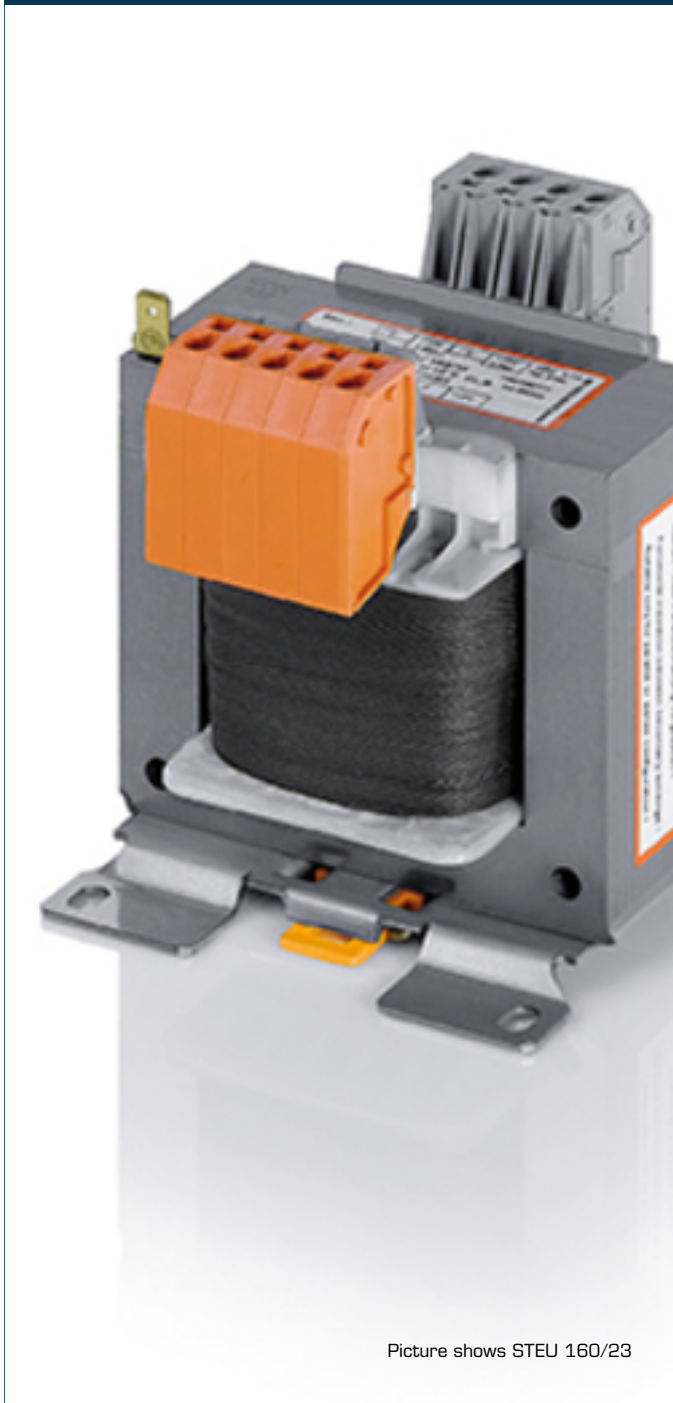
Picture shows STEU 160/23