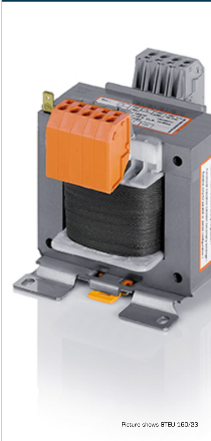
Picture shows STEU 160/23