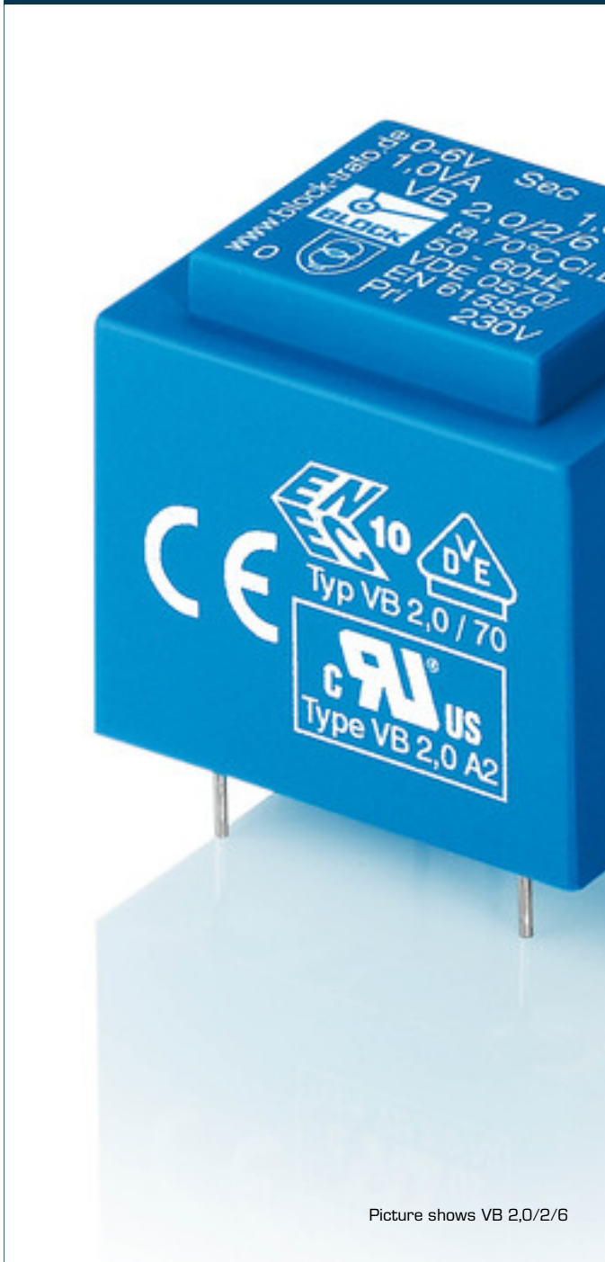
Picture shows VB 2,0/2/6