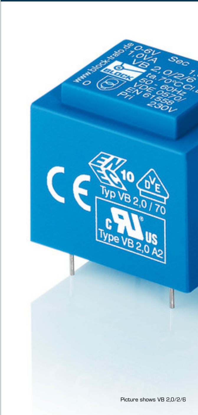
Picture shows VB 2,0/2/6