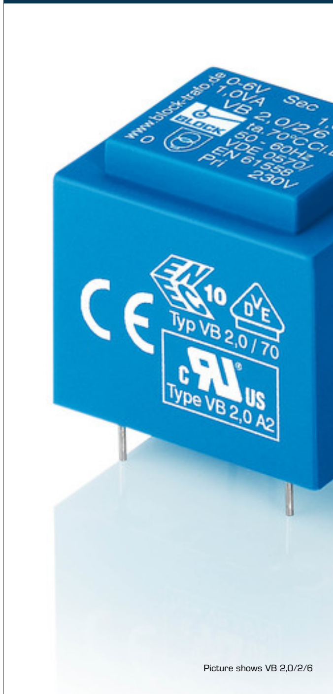
Picture shows VB 2,0/2/6