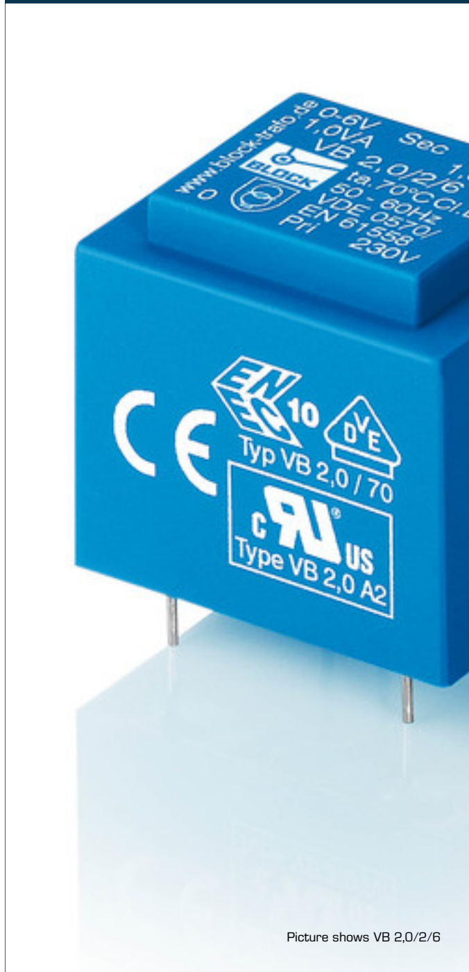
Picture shows VB 2,0/2/6