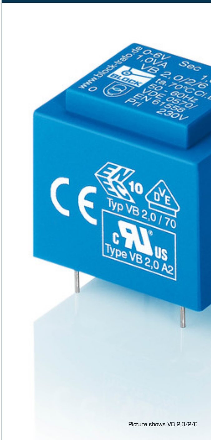
Picture shows VB 2,0/2/6