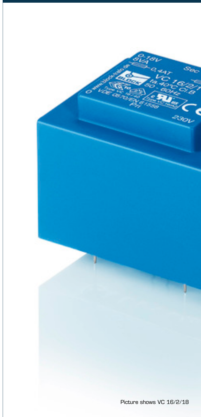
Picture shows VC 16/2/18