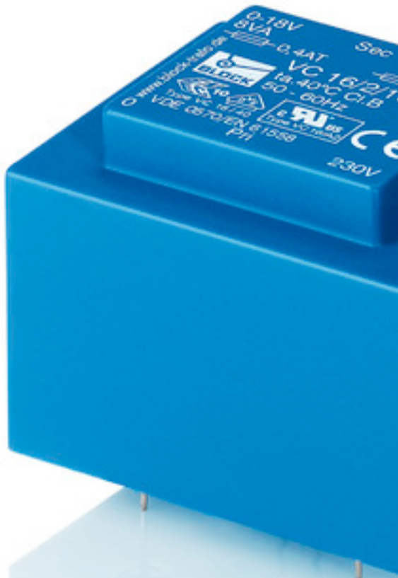
Picture shows VC 16/2/18