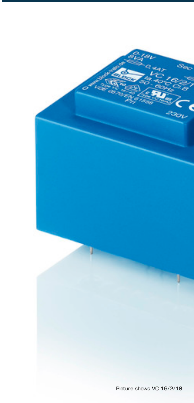
Picture shows VC 16/2/18