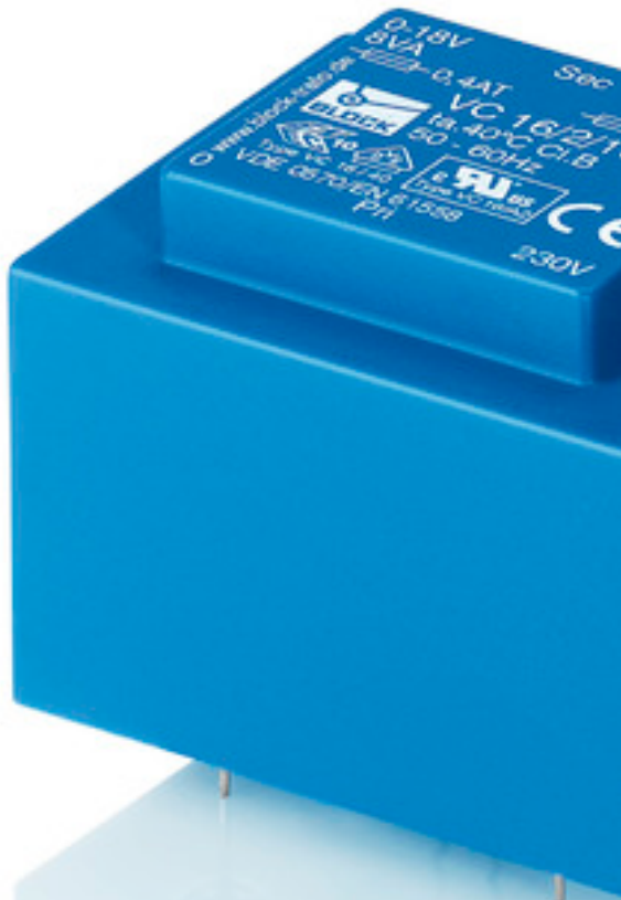
Picture shows VC 16/2/18