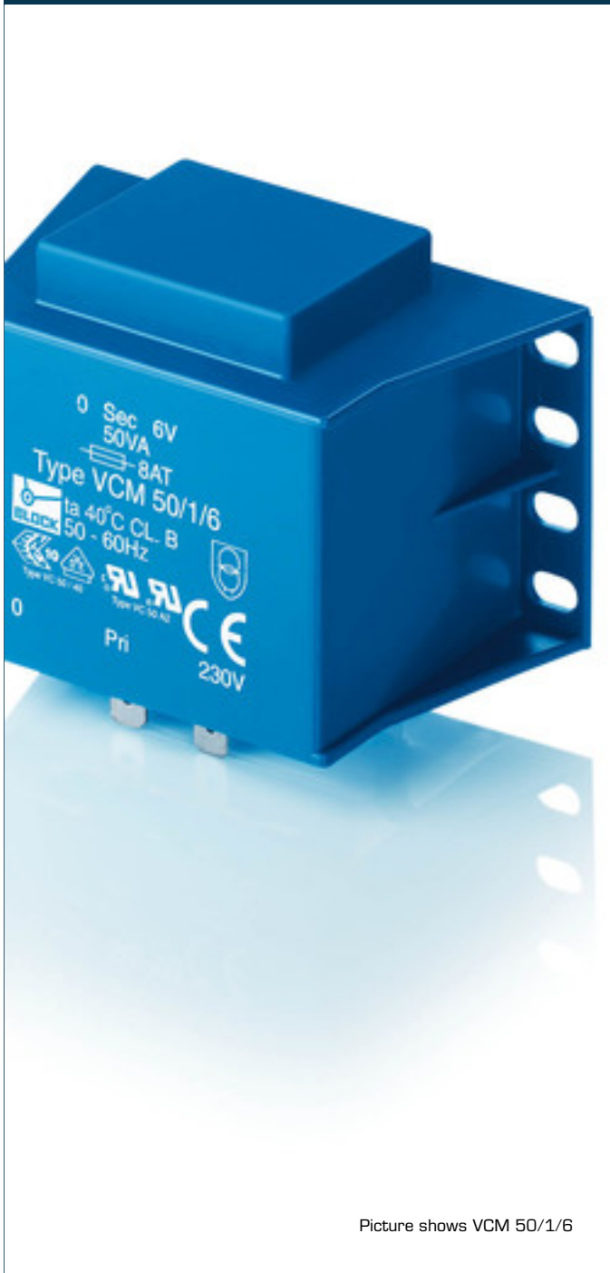
Picture shows VCM 50/1/6