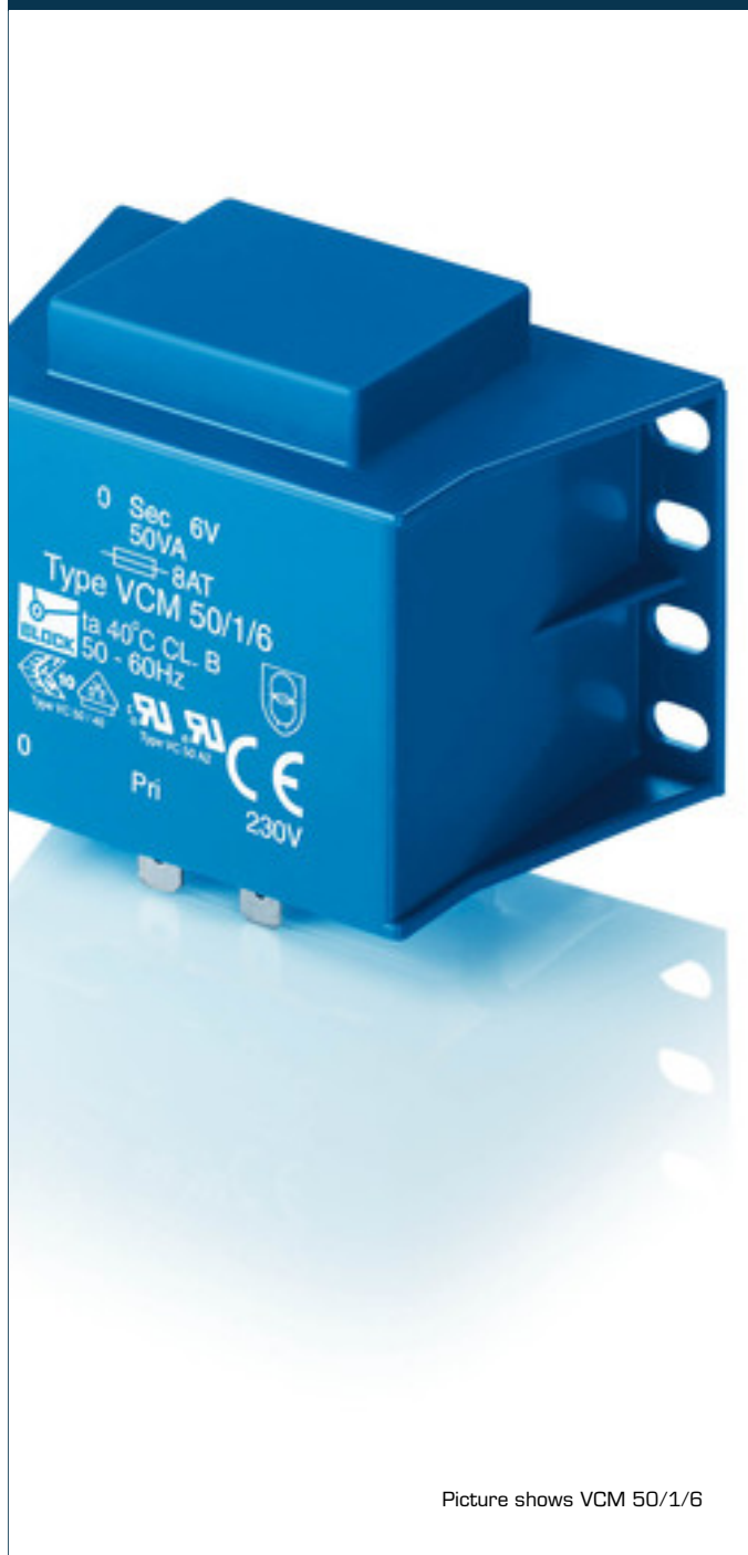
Picture shows VCM 50/1/6