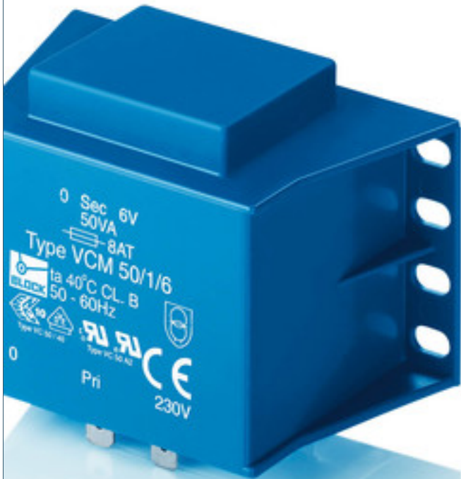
Picture shows VCM 50/1/6