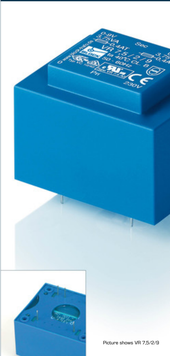
Picture shows VR 7,5/2/9