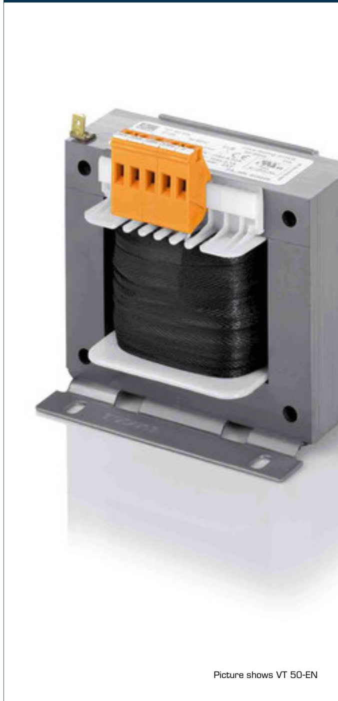
Picture shows VT 50-EN